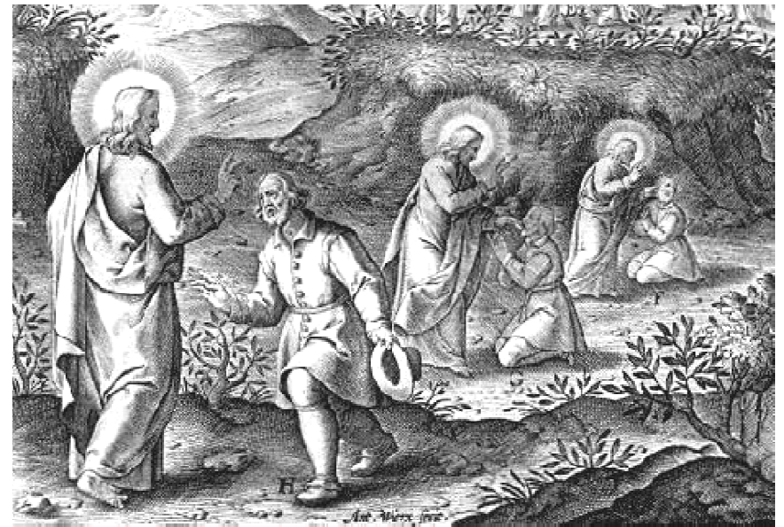
Jesus Heals the Deaf-Mute, Jerome Nadal's 'Evangelicae Historiae Imagines', 1593.